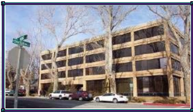
Distinctive Entry on West King Street