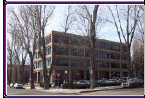
Private Parking Lot on North Side of the Building